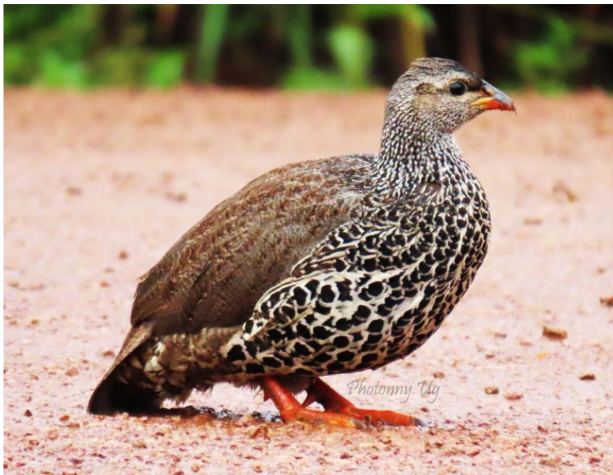
Hildebrandt's Francolin in Akagera National Park

with Cattle Egrets and some resident Grey Crowned Cranes . Lasted a beat and walking back to find the car as it was approaching 500hr.