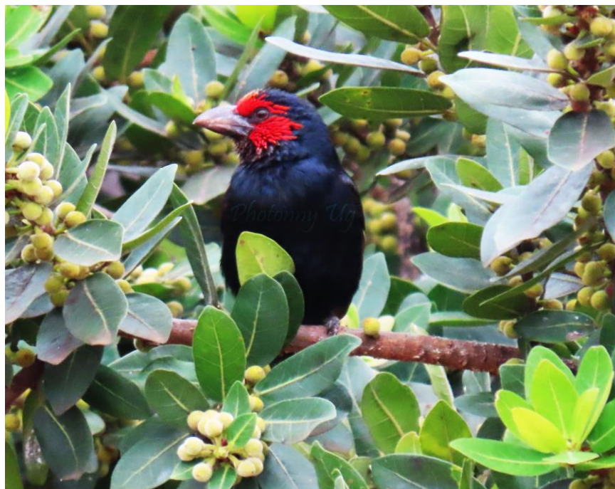
Red-faced Barbet, one of the highlights of Akagera National Park

birds. The night game drive began at sunset during which we spotted Hildebrandt's Francolin, European Bee-eater, Cardinal Quelea and Red-necked Francolin . The night drive wasn't fruitful for the nocturnal birds due to wet weather.