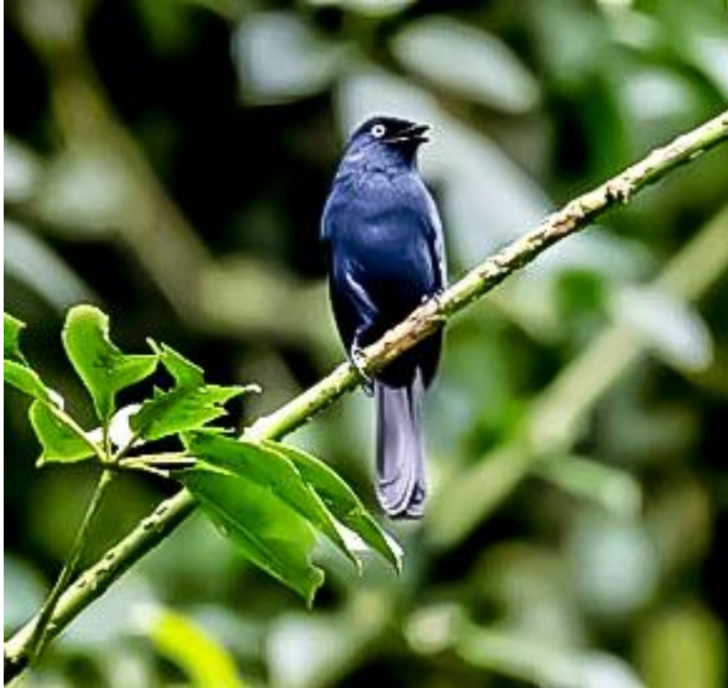
Yellow-eyed Black-Flycatcher.