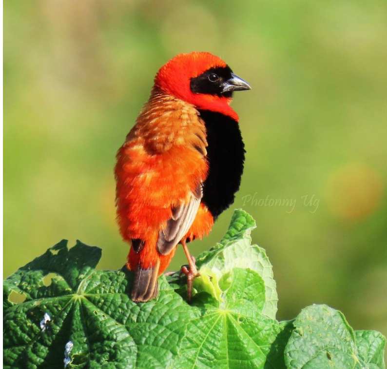
Southern Red Bishop

6:30am was breakfast and 7:00am found us boarding the boat to look out for the water fowls', Black Kites were all over, Fan-tailed Widowbird , Southern Red Bishops , Pied , African Pygmy and Malachite Kingfishers , showed up well, on another side of lake Kivu, we docked, and walked in the gardens of Paradise Malahide's new sister lodge called Paradise Kivu, White-tailed Blue-Flycatcher , Yellow-fronted Canary , Spot-franked Barbet , Collared , Variable and Copper Sunbirds , Red-billed Firefinch were busy feeding in the gardens. African Harrier Hawk flew in and took a nice position for a snap, went back at the lodge and got into our car, straight to hospital in Rubavu town, took a PCR covid test and turned to the lodge for lunch.