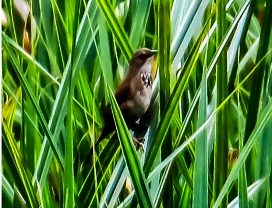
Grauer's Swamp Warbler