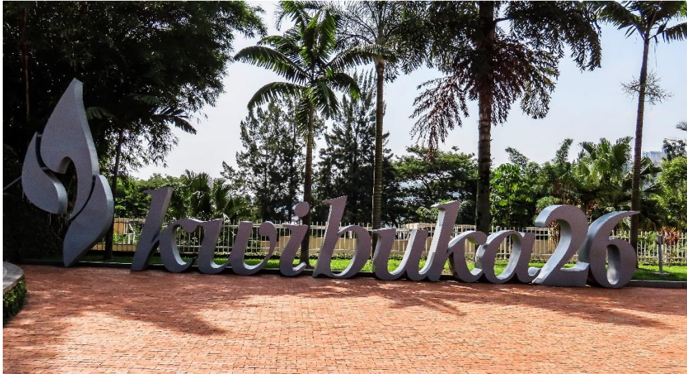
Kigali Genocide Memorial

Day 17. Jan 29 th - 2021 visited Genocide memorial and departure.